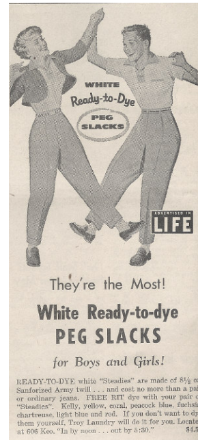
New Utica Ad