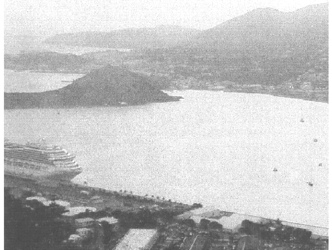
Harbor at Sunset