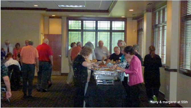
Buffet Line at Copper Creek Golf Club