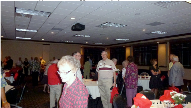
Milling around and talking Saturday Night