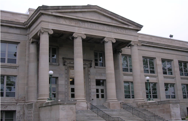
You will be glad to know that the west steps and view remain as we remembered it.