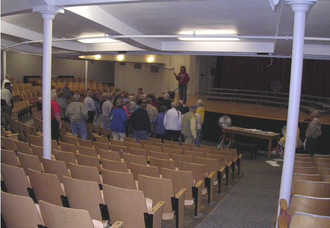
Stage has been extended out in auditorium.