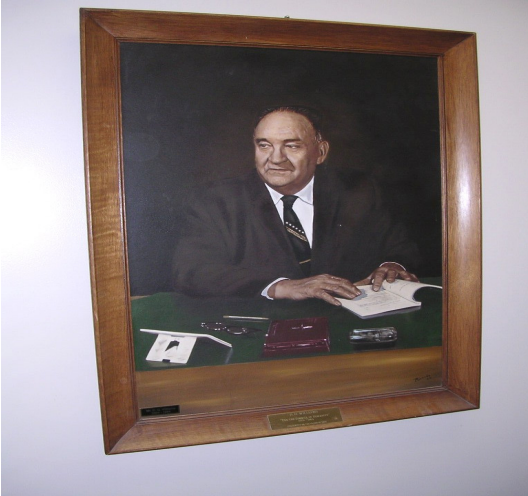
Duke Williams picture hangs in the office.