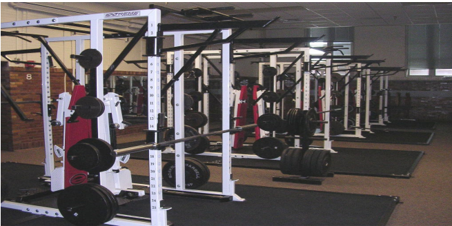
Old gym is now weight lifting and exercise room.