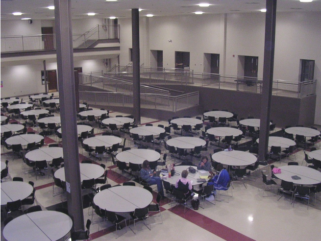
All Purpose area between east side of old bldg. and old gym.