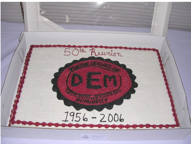
One of two cakes which would later become our dessert