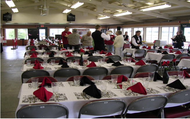
Set up for Friday Night at Prairie Meadows