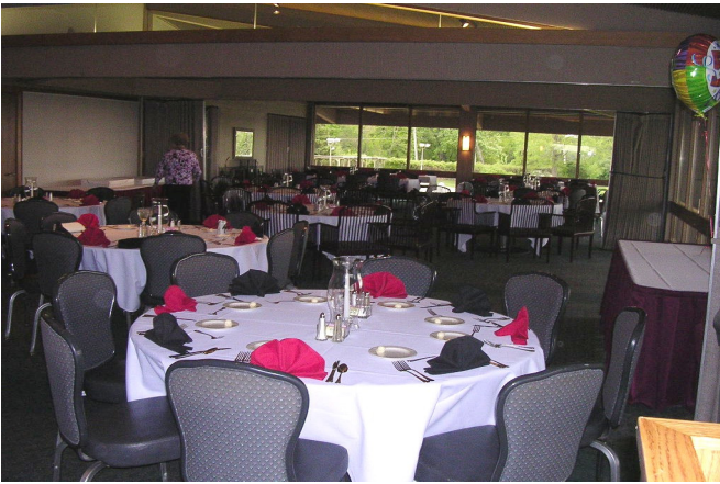
Elegant setting with a great view not only of the golf course, but you could even see some of the tall buildings downtown.