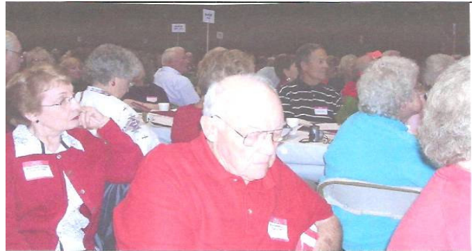
Annual Alumni Association gathering on Thursday night.