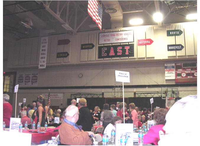
Looking forward to Stage